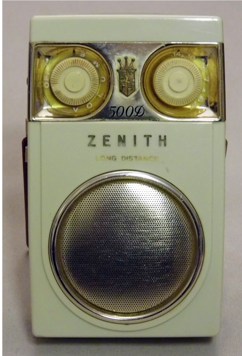
Zenith Royal 500D "Long Distance" 8-Transistor AM Radio