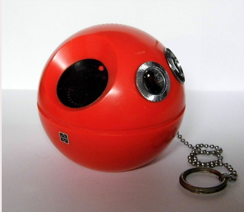
Vintage Panasonic Red-Orange Panapet 70 Ball'n Chain Radio.